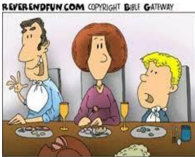
I WOULD BE ABLE TO GIVE A LOT MORE THANKS IF I DIDN'T HAVE TO FINISH OFF THESE LIMA BEANS